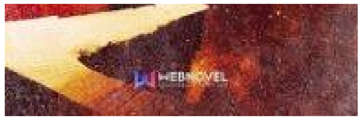
Source: <u>https://boxnovel.com/novel/the-boss-behind-the-game</u> Generated by <u>Lightnovel Crawler</u>